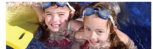
LIFETIME LIMITED WARRANTY ON CLEANING NOZZLES